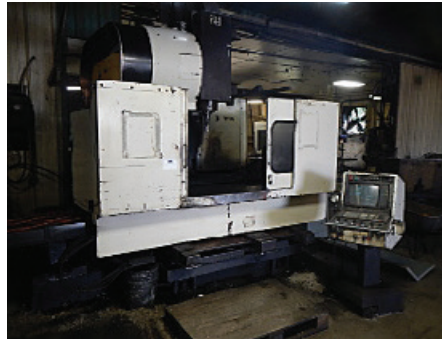
Mitsubishi V-65 4-Axis Vertical Machining Center