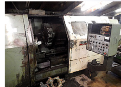
1981 Ikegai AX30 CNC Machining Center, 28" x 60"