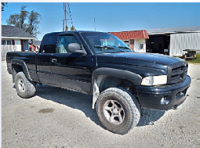
2001 Dodge 4x4 Pickup