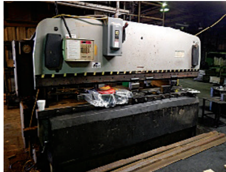
Promecam 110 Ton 10' Press Brake w/ CNC99 Controller