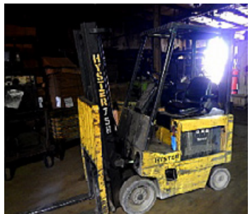
Hyster 3,500 lb. Electric Fork Truck