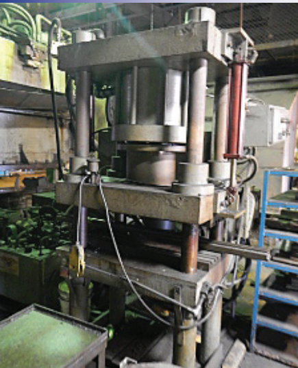
200 Ton 4-Post Hydraulic Press