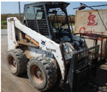
Bobcat 863 w/Attachments