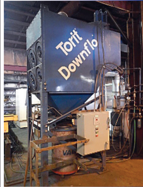
Torit Downflo System

THIS IS A HUGE SALE WITH TOO MANY LOTS TO MENTION, PLEASE GO TO OUR WEBSITE WWW.SMCCOMPANY.COM FOR FULL LISTINGS!