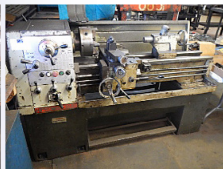
HPM 14" x 40" Engine Lathe