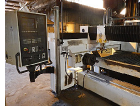
Balliu LC1500 OG/RTX Laser Cutting System