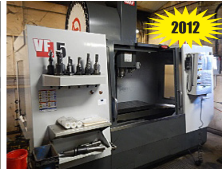
HAAS VF5-50 Vertical Machining Center