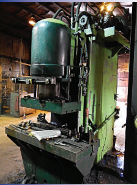
Pacific 300 Ton C-Frame Hydraulic Press