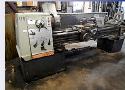
Clausing Colchester Engine Lathe