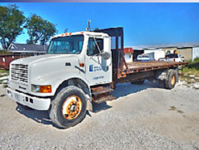
International 4700 w/Flatbed