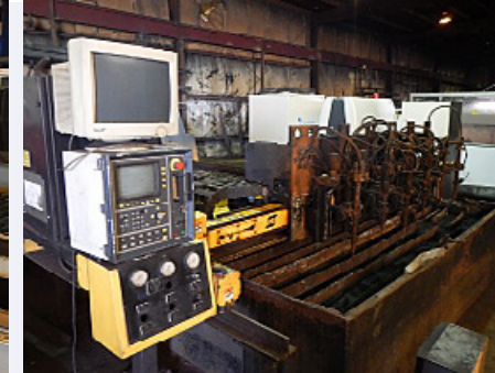
ESAB Sabre 2000-10 6-Head, 20' x 40' table