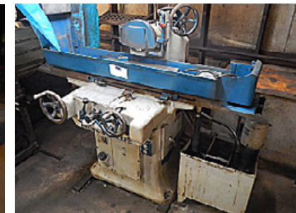
Brown & Sharp 8" x 24" Surface Grinder