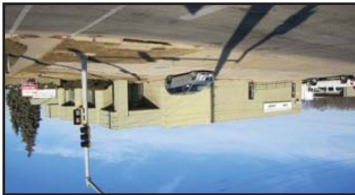
Winterbottom Supply Co. 540 Ansborough, Waterloo, Iowa

Visit our Website - www.backes-auction.com